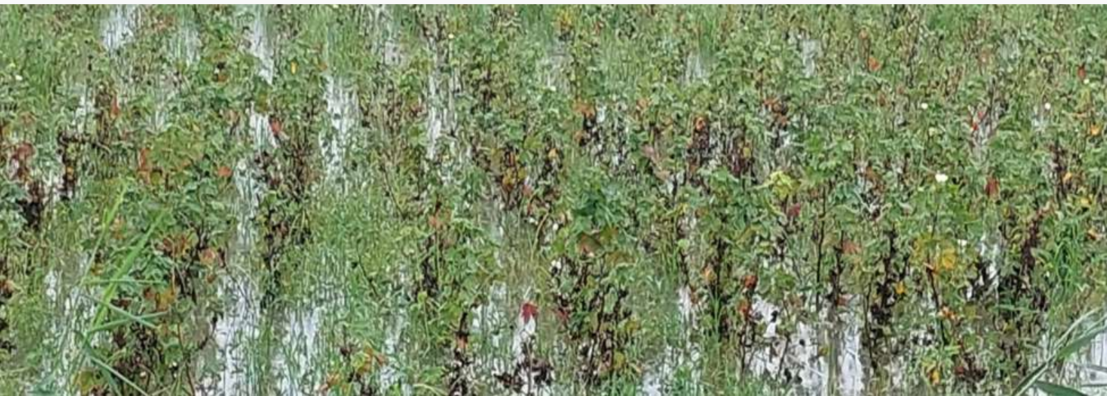
Water Standing in Crops ( Cotton) at District Sanghar