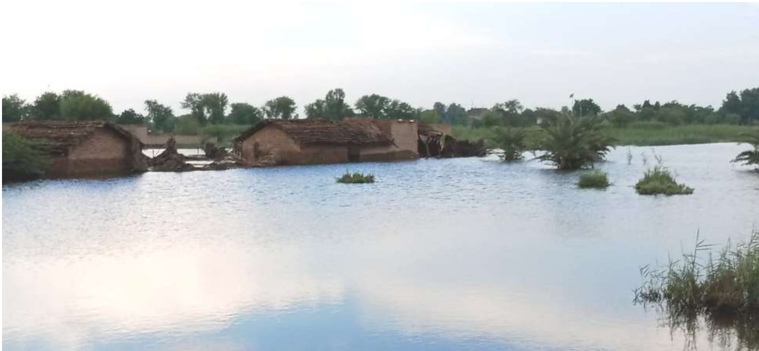
Water Standing in Village and no connectivity and Relief operations issue