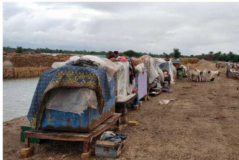
Shelter less Community