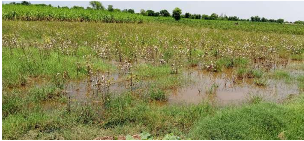
Water Standing in Crops