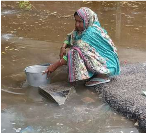
Drinking Water Issue