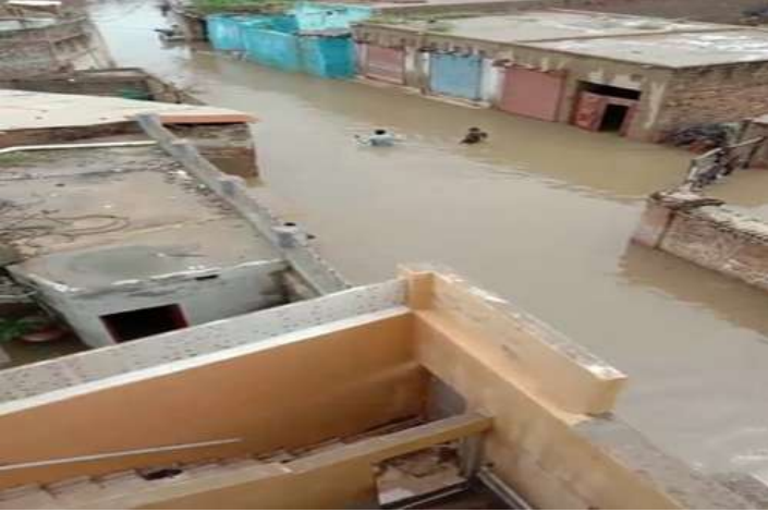
Mirpurkhas-Jhuddo City under water