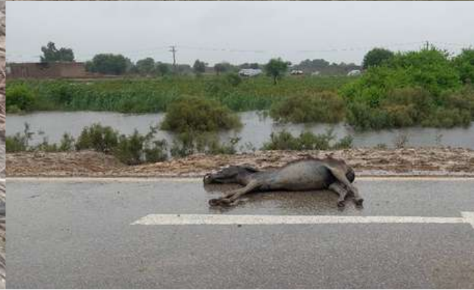
Livestock Death District Sanghar