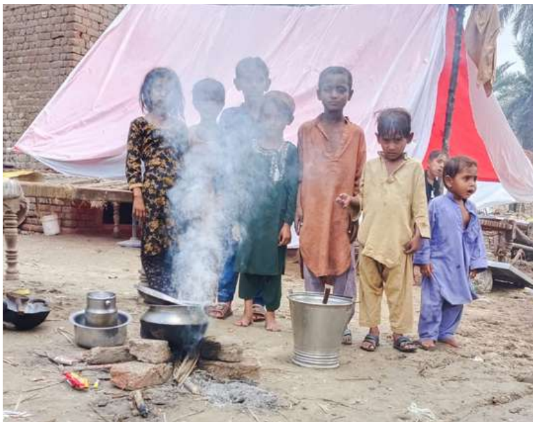
Food Cooking Issue due to wood in water