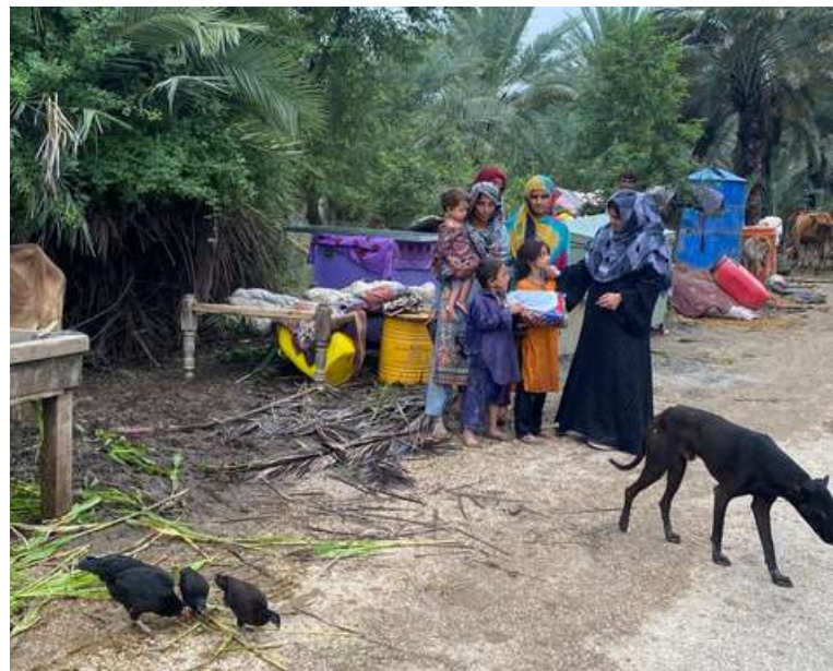
Shelter less Community