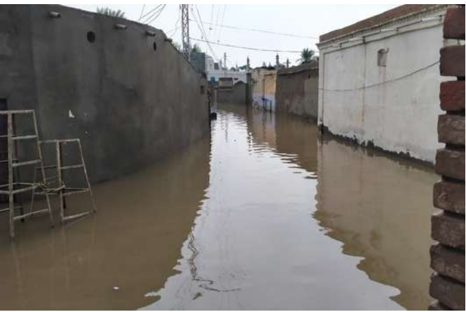
Water Standing in Urban Cities Streets