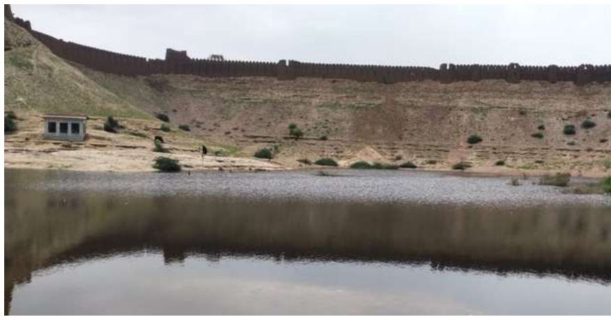
Water Standing at Fort of KotDiji-