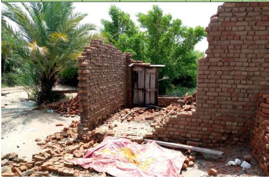
IRA-Assessment of Torrential Rain/Flood.