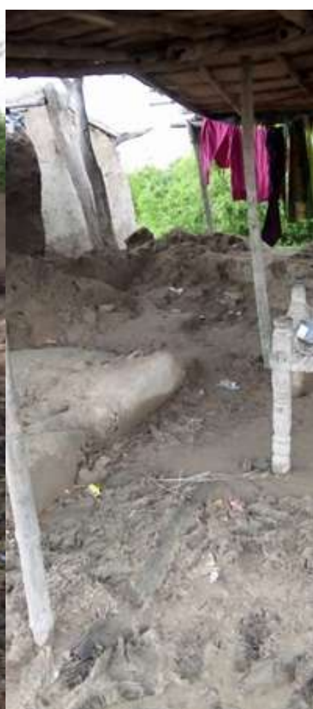
Badin-Village Ve makan VO Ve Makan UC Gharo