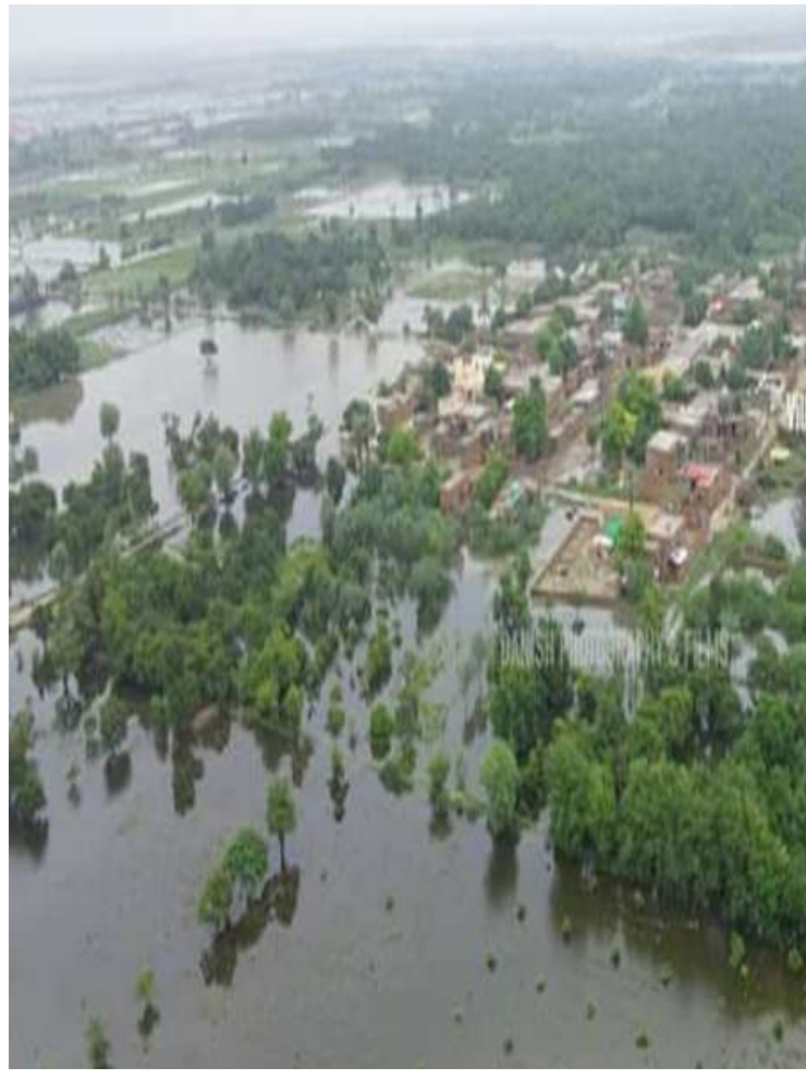
Village Baghan Wali, UC Haji Wadal Shah, Taluka Shujabad-Mirpurkhas