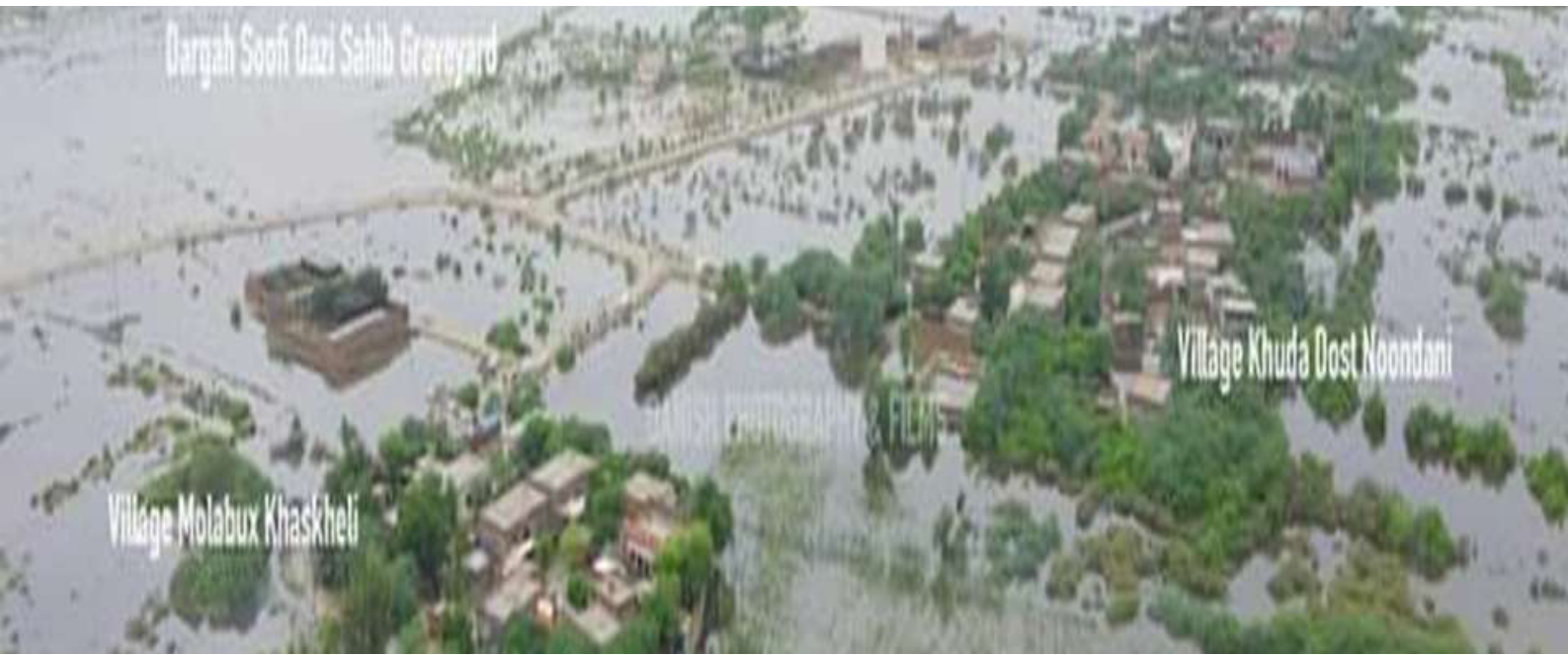
Village Molabux Khaskheli