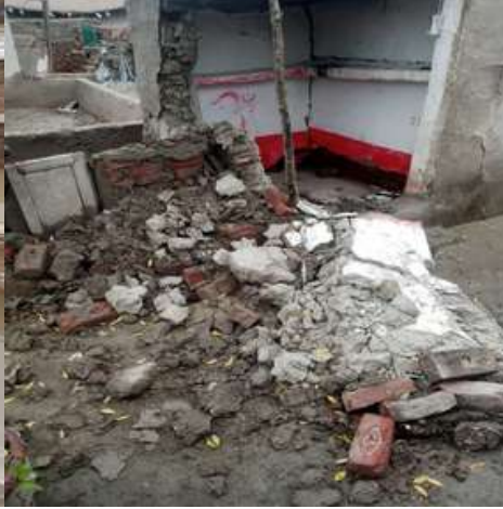
Village Ahmed Khan Narejo Taluka Sindhri