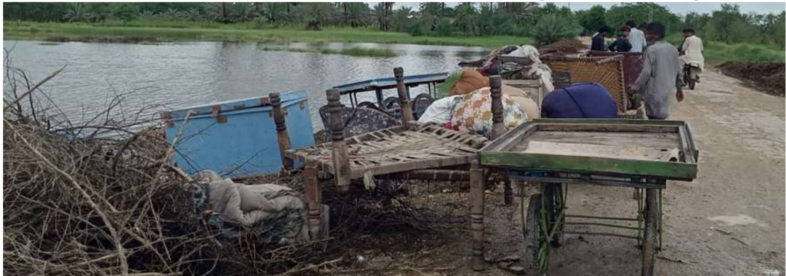
Road Side Community living in Open Sky waiting for cooked Food and sitting Hungry.