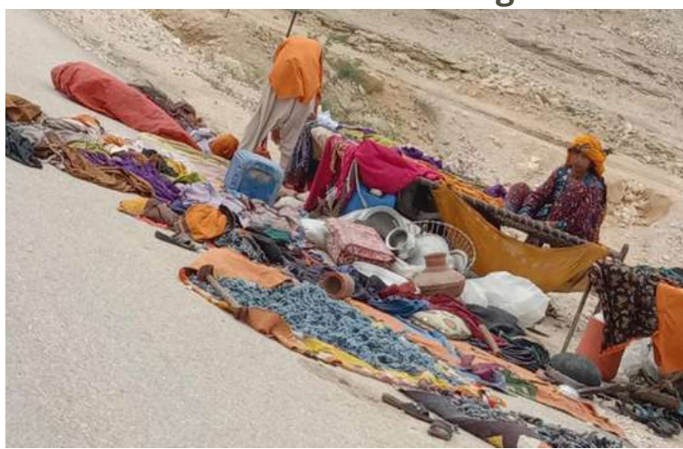
Migration of Households