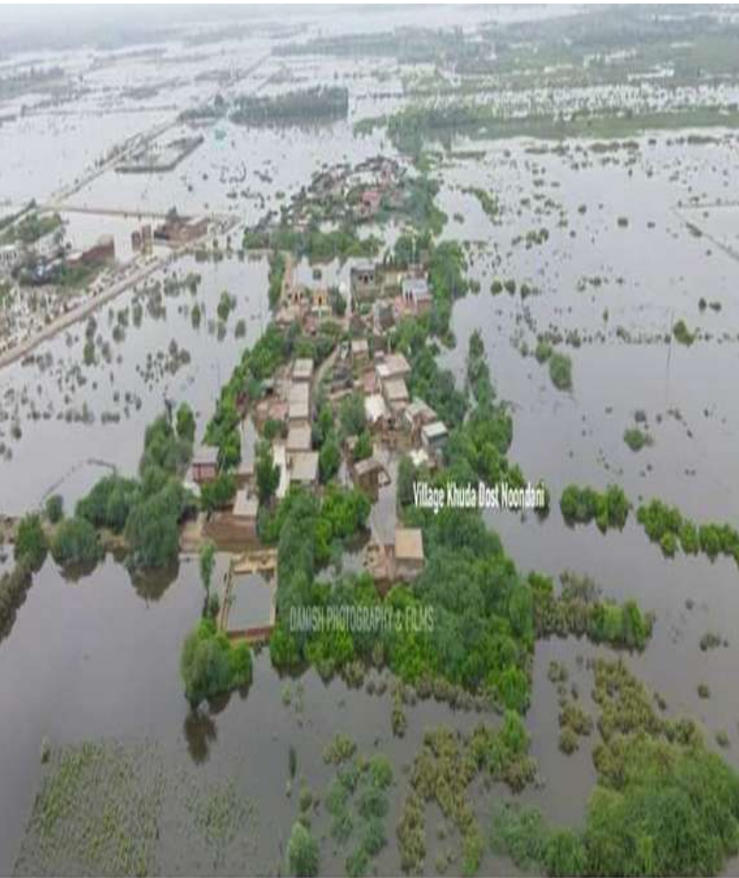
Village Khuda Nondani, UC Khunbhri, Taluka Shujabad-Mirpurkhas